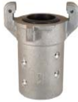
Q-4X for 1-1/2" Hose