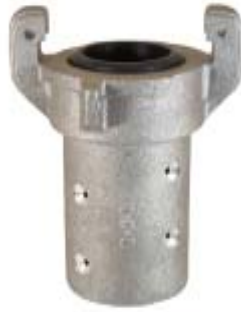
Q-3X for 1-1/4" Hose