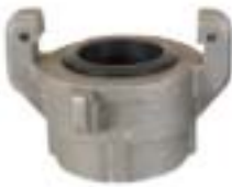
SB-3X for 1-1/2" Pipe