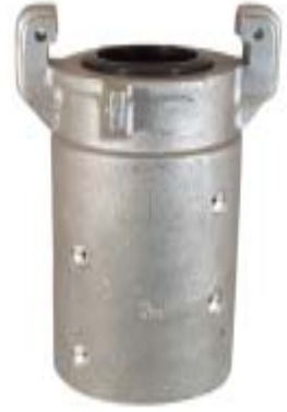
Q-6 for 2" Hose