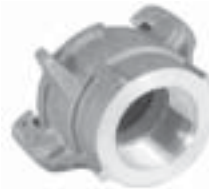
SB-4X for 2" Pipe

Aluminum or Brass 150 PSI maximum recommended operating pressure These couplings are extra large and will not interchange with smaller sizes.