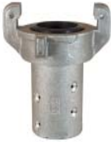
Q-2X for 1" Hose

Full Port couplings for High Volume applications. 35% More Volume with 1-1/2" hose. Higher Pressure Rating. Less Gasket Wear.