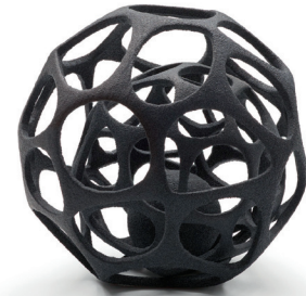
Picture taken after dye post-processing